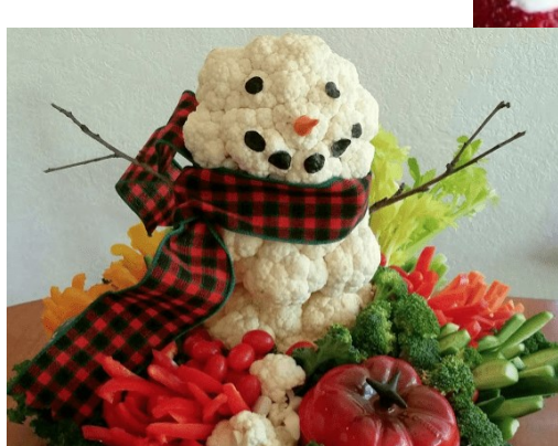
Snowman Veggie Tray