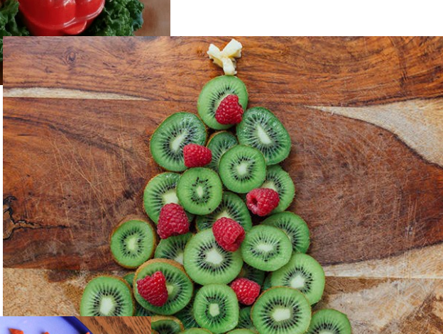
Fruit Xmas Tree