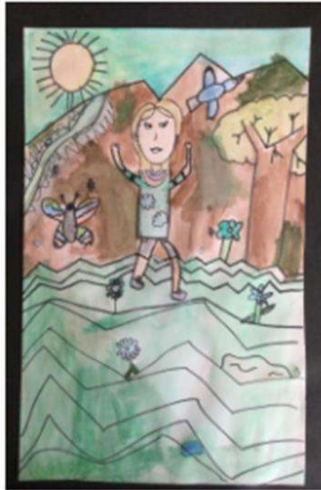
Claira Bothwell Church